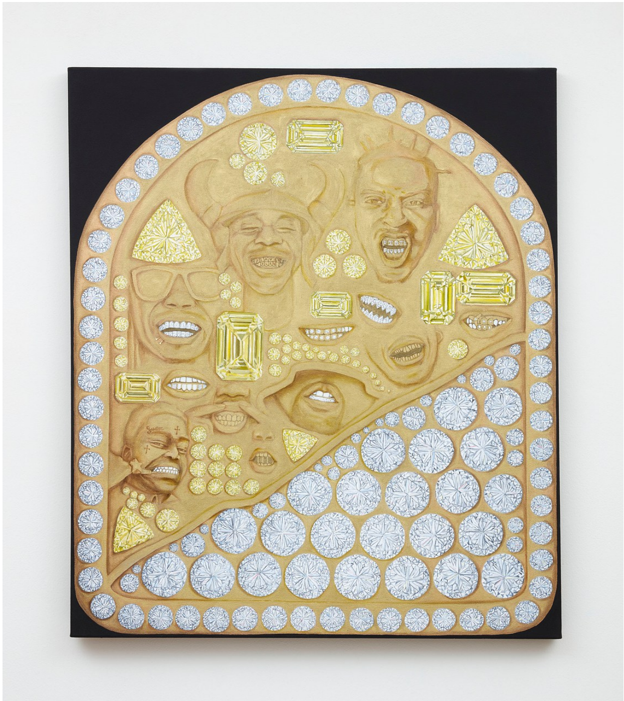
Troy Chew Three Crowns (7) , 2020 Oil and acrylic on canvas 42 x 36 inches (106.68 x 91.44 cm)