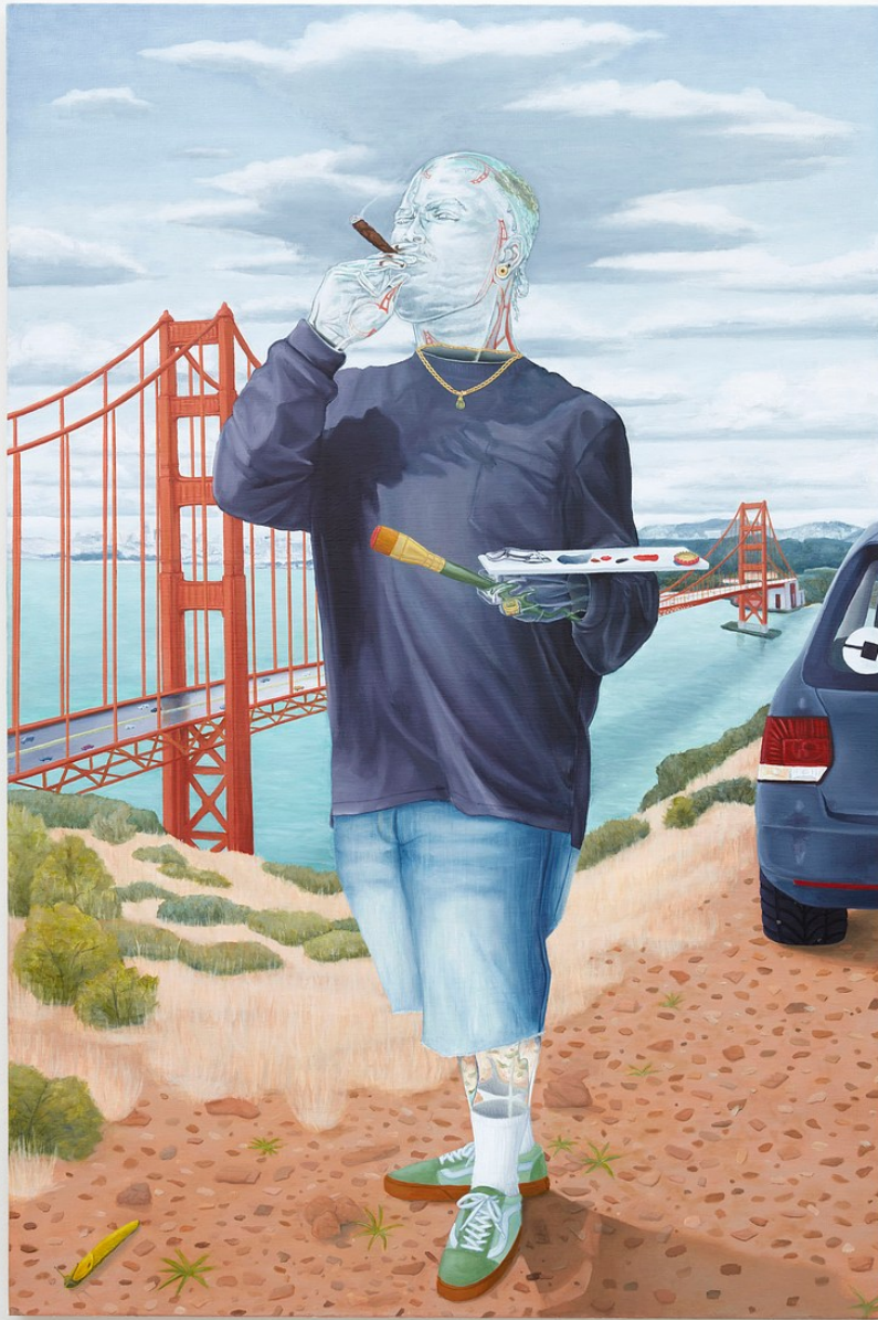
Troy Chew The Invisible Man , 2020 Oil on canvas 60 x 40 inches (152.4 x 101.6 cm)