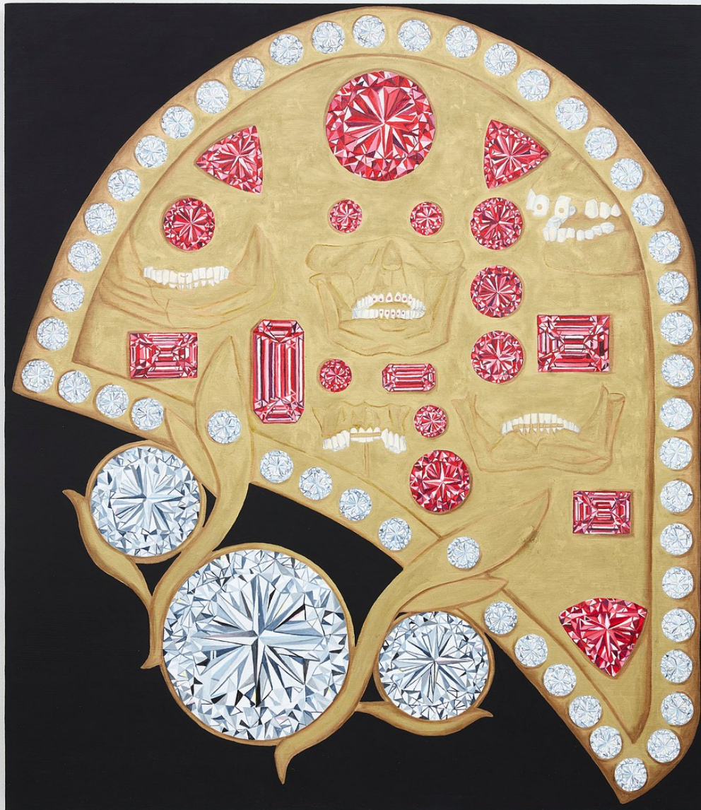
Troy Chew Three Crowns (9) , 2020 Oil and acrylic on canvas 46 x 40 inches (116.84 x 101.6 cm)