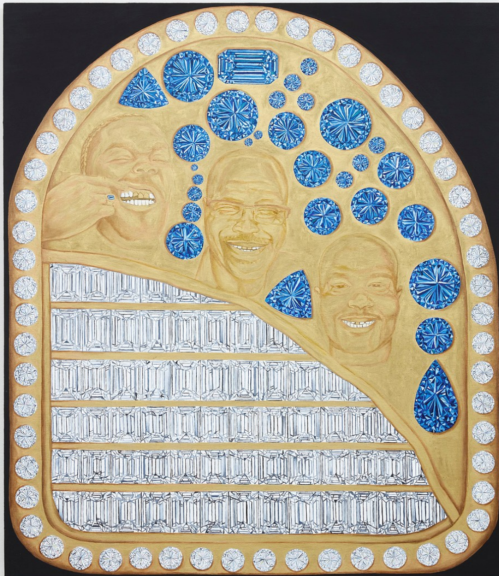
Troy Chew Three Crowns (8) , 2020 Oil and acrylic on canvas 46 x 40 inches (116.84 x 101.6 cm)