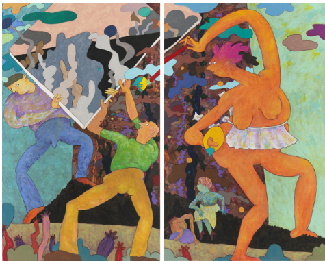
Gladys Nilsson, "Gleefully Askew" (2019), acrylic on canvas, 84 x 112 in., collage

Nilsson's paintings come across as youthful and wise, a rare combination in any art.