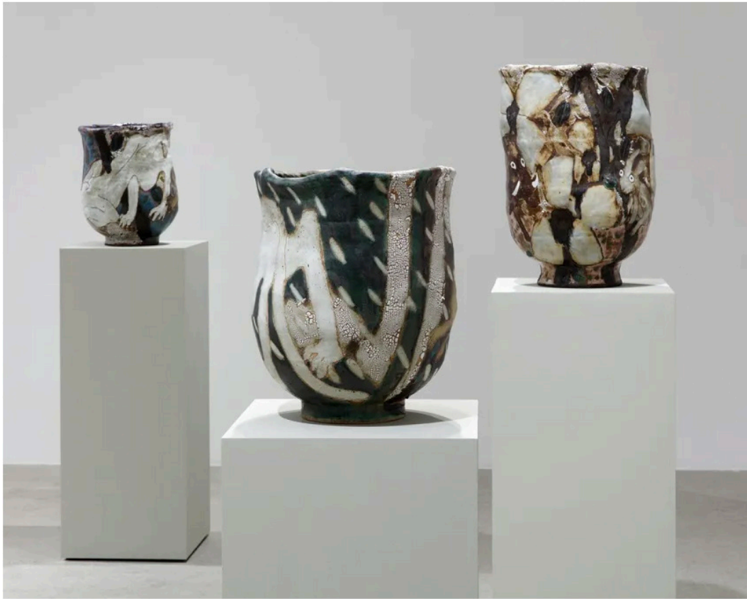
Karin Gulbran, Splendor in the Grass (installation view) (2015).

Pottery occupies the realm of discrete objects moreso than sculpture, its umbrella genus. As objects, Karin Gulbran's pots in Splendor in the Grass , currently on view at China Art Objects, are marked by the ghost of functionality—recalling, perhaps, the sacred and often mysterious functions of ancient ritual containers.