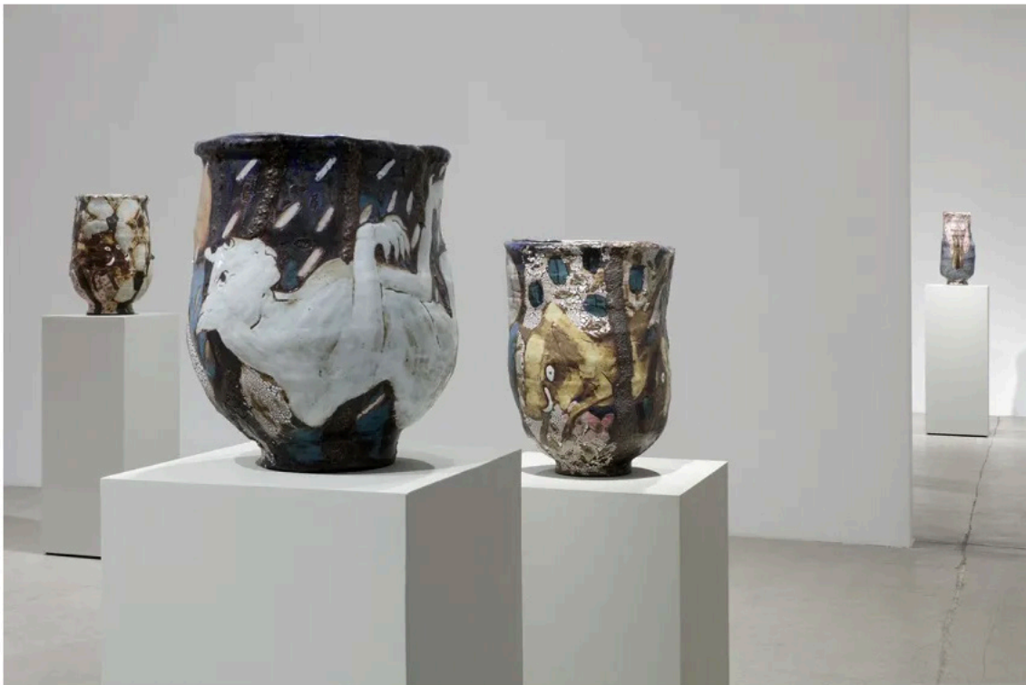
Karin Gulbran, Splendor in the Grass (installation view) (2015).

Karin Gulbran: Splendor in the Grass runs November 7—December 19, 2015 at China Art Objects Galleries (6086 Comey Avenue, Los Angeles, CA 90034).