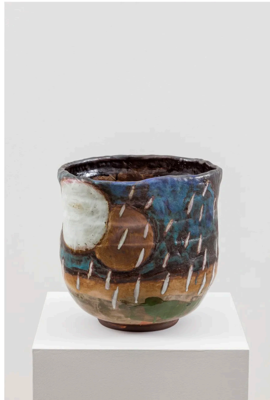
Karin Gulbran, Cat Chasing a Rabbit (2015). Stoneware, 17.5 x 17 x 15 inches.