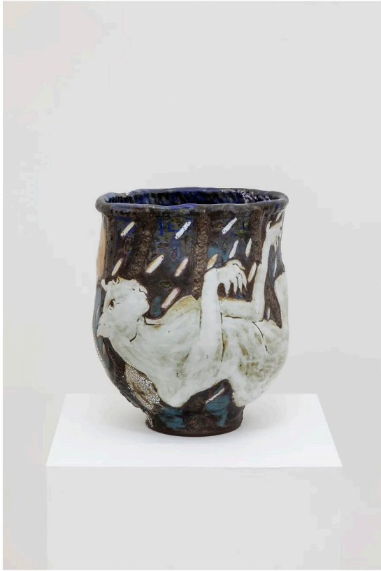
Karin Gulbran, Fallen Cat in Rain (2015). Stoneware, 17.5 x 17 x 14 inches. Image courtesy of the artist and China Art Objects Galleries. Photo by Joshua White.