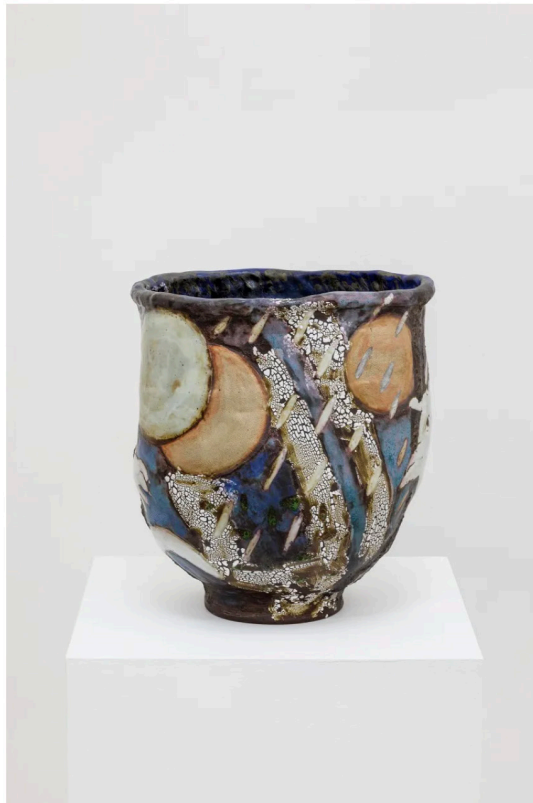
Karin Gulbran, Fallen Cat in Rain (2015). Stoneware, 17.5 x 17 x 14 inches.