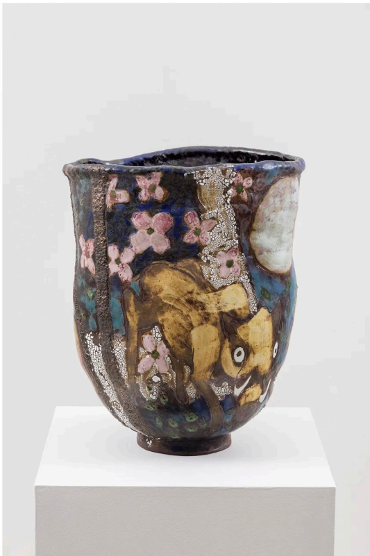
Karin Gulbran, Family of Boar (2015). Stoneware, 21 x 17.5 x 15 inches.